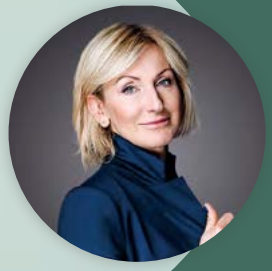
Joanna Benz Longevity Center | Poland